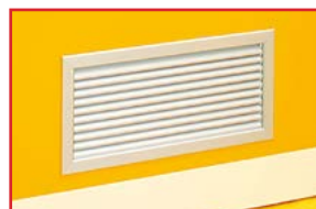
Grill - airing plates