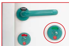
Resin antibacterial handle