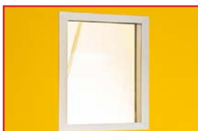
Standard view with frame

PONZI ALU door can be provided with various options as window of various sizes and shapes, double glass with Venetian blind for the total obscuring and airing grill made of aluminium or PVC.