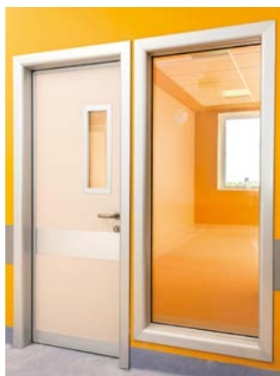
ALU with fixed window of ambulatories