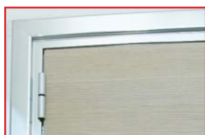
PLASTIC LAMINATE - Wood-look