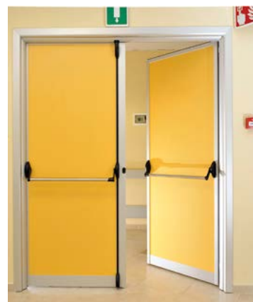
Double hinged ALU with push bar for emergency exit