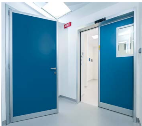
Hinged and sliding ALU door with automatic option