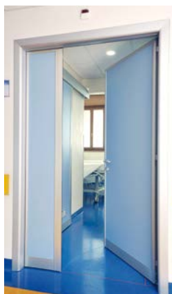
ALU patient's rooms