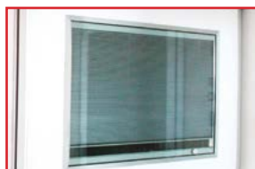
View with obscuring blind