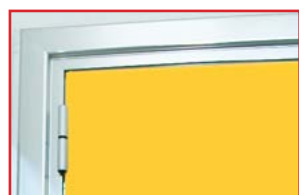
PLASTIC LAMINATE - Color series

The perimetral intradoses and the frames are realized with finishings in silver anodized electrocolor ARS1, painted RAL or polished similar to Stainless Steel. The door panel can be in colored laminate, wood-look or Stainless Steel.